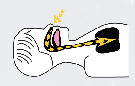
Normal jaw position, airway open.